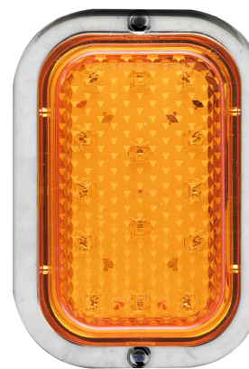
Rear Indicator 130AMC - Single Blister