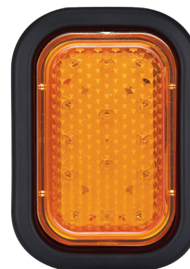
Rear Indicator 130AMG - Single Blister 130AMB - Light Only Bulk