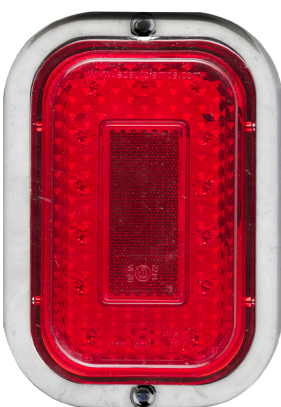
Stop/Tail 130RMC - Single Blister