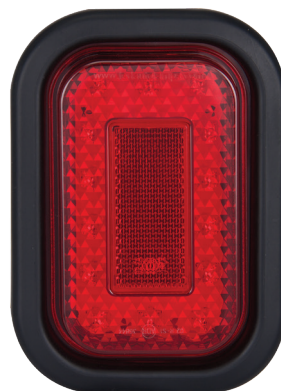
Stop/Tail 130RMG - Single Blister 130RMB - Light Only Bulk