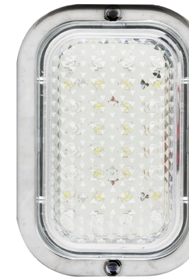
Reverse 130WMC - Single Blister