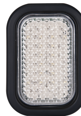
Reverse 130WMG - Single Blister 130WMB - Light Only Bulk